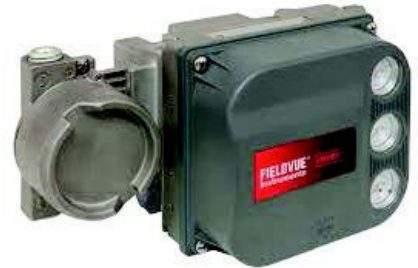
FIELDVUE™ DVC6200 Digital Valve Controller