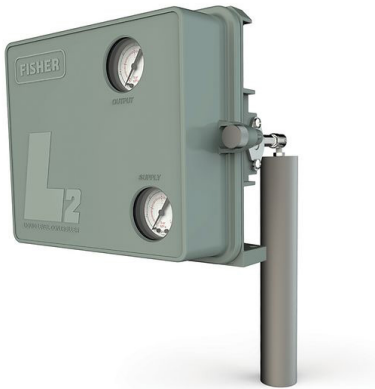
Improved L2 Level Controller